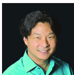
Hugh Sung piano